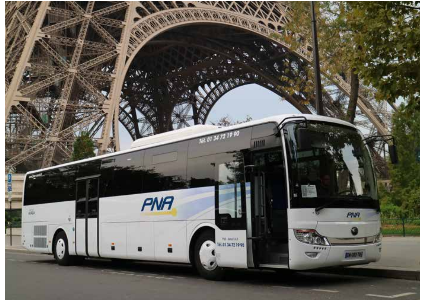
Yutong bus in front of the Eiffel Tower

Indeed! Different from any previous tours, this time Yutong is our carrier, taking all of us to a host of globally renowned tourist attractions in Paris, such as the Eiffel Tower, the Louvre, the Notre Dame, Seine River, etc.