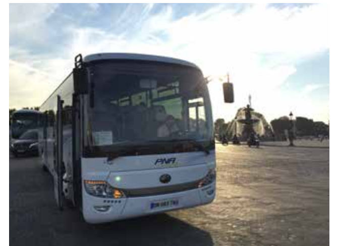
Yutong bus at the Place de la Concorde

Zigzagging through the streets in Paris, Yutong tourist coach is surely an eye-catcher in the crowd thanks to its uniquely fashionable design and overpowering body structure. While on an urban tour with Yutong coach, tourists experience a host of comforts on board, leaving all of them an unforgettable traveling experience.