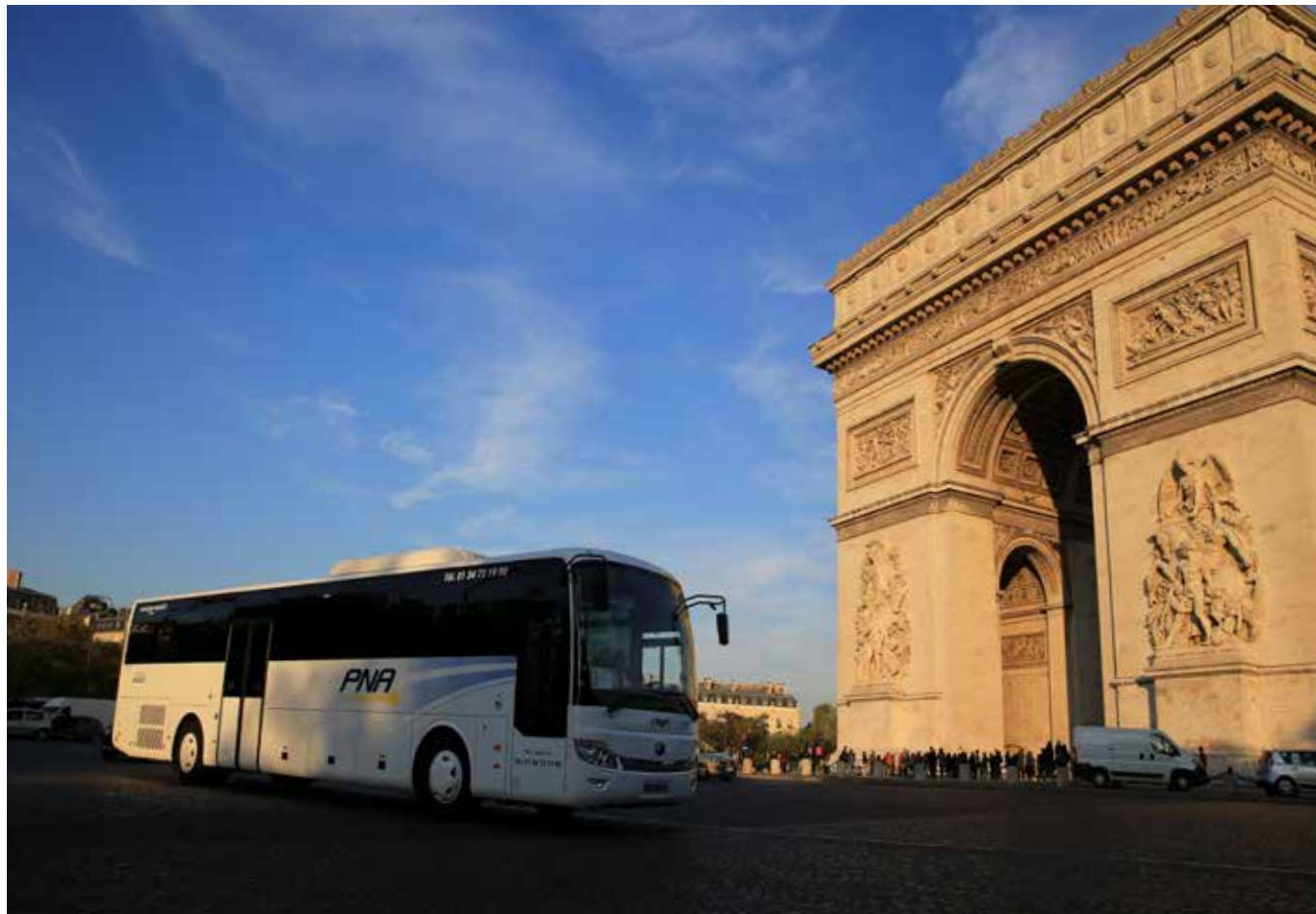
Yutong bus passing the Triumph Arch

LACROIX is one of the largest privately owned bus operators in Paris. When asked when buses made in China can have a much more visible presence in the metropolis, the president of LACROIX replied, “China has already made it as you are now touring on a Yutong bus. I believe more and more Yutong buses will join our bus fleet in the near future.”